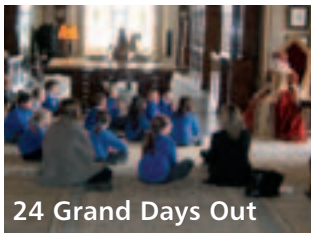
24 Grand Days Out