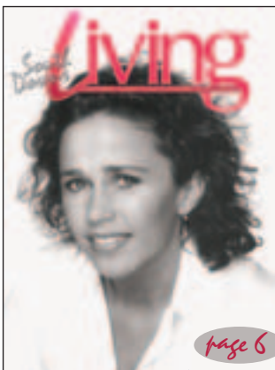
page 6 cover story