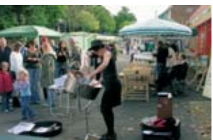
23 Food & Drink