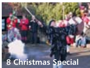
8 Christmas Special