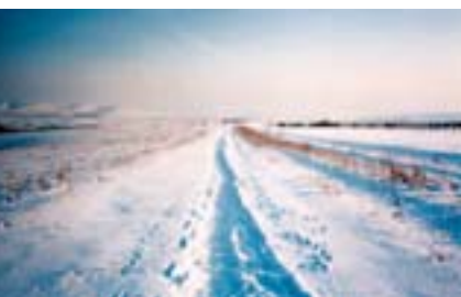
10 Readers' Competition